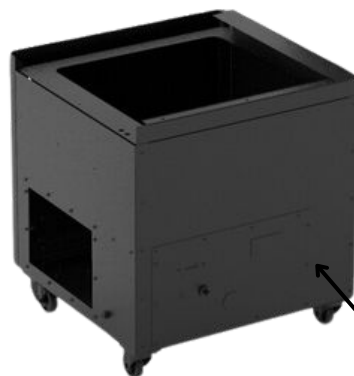
ATEX BASE LOWER MODULE PRIMARY FILTER BAS-V6-AS43